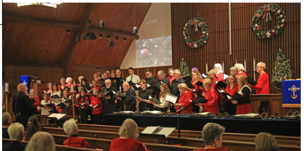
Chancel Choir joined by Vocal Impact