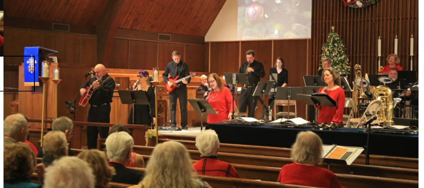
Praise Band rocking to Jingle Bell Rock